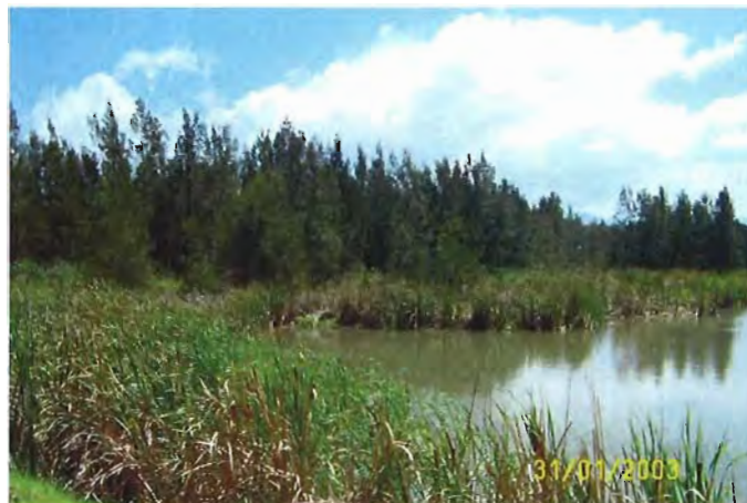
Photograph 2: Shows completed section of rehabilitated lake foreshore

The environmental assessment is in the process of being finalised and is expected to be completed next month. We are confident, based on initial investigation, that there will be no net adverse environmental impacts to the site. Progressive construction of the pond foreshores will provide more wetland areas similar to the existing area shown in Photograph 2.