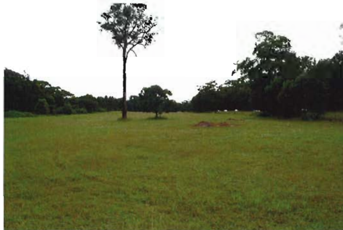
Photograph 1: Shows farmland to be quarried for sand.

The application by Cleary Bros proposes to extend sand extraction operations onto the company's land to the north of the current sand quarry. The area proposed for extraction is cleared farm and timbered land.