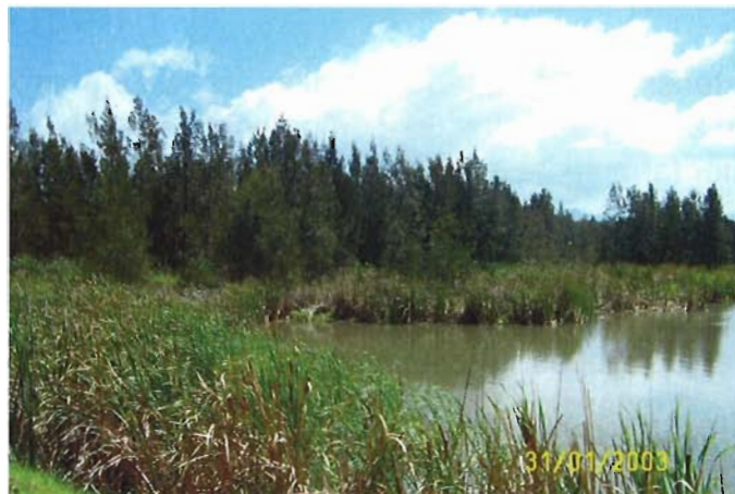
Photograph 2: Shows completed section of rehabilitated lake foreshore

The environmental assessment is in the process of being finalised and is expected to be completed next month. We are confident, based on initial investigation, that there will be no net adverse environmental impacts to the site. Progressive construction of the pond foreshores will provide more wetland areas similar to the existing area shown in Photograph 2.