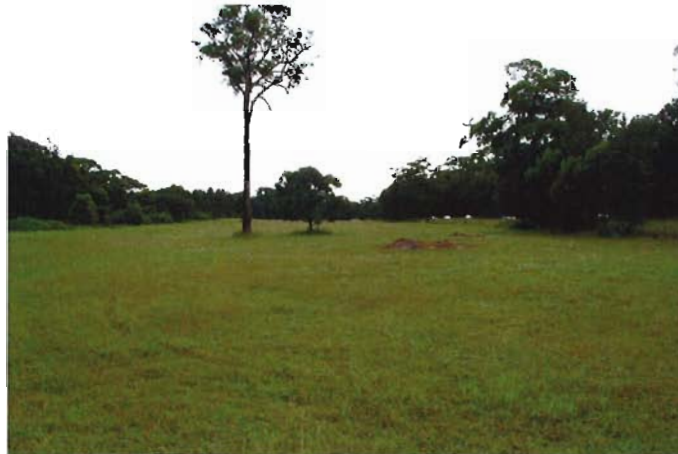
Photograph 1: Shows farmland to be quarried for sand.

The application by Cleary Bros proposes to extend sand extraction operations onto the company's land to the north of the current sand quarry. The area proposed for extraction is cleared farm and timbered land.